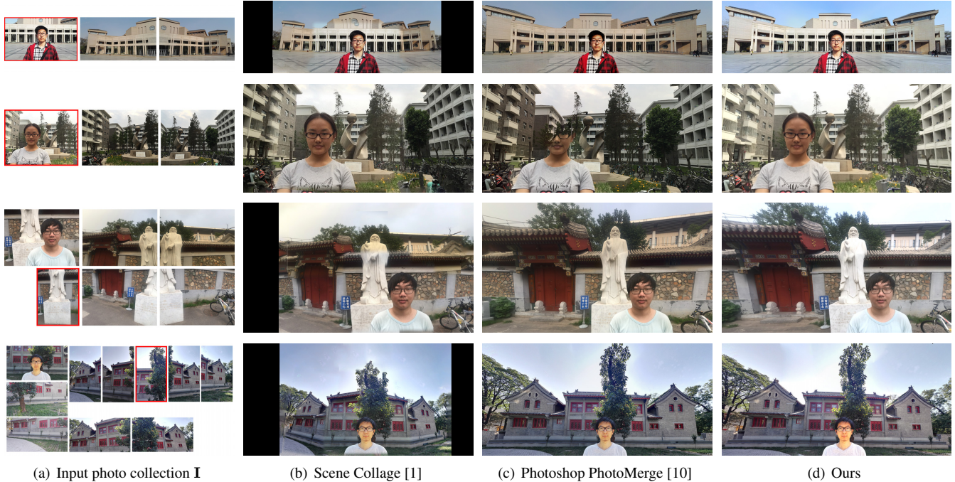
Fig. 3. Comparisons with [1] and [10]. (a) The input photo collections \mathbf{I} . The lighting style references I_t are marked with red boxes. (b) Results of Scene Collage [1]. (c) Results of Photoshop PhotoMerge [10]. (d) Our results. Best viewed in color.

where \Psi_i(x) and \hat{\Psi}(x) are the patches centered at pixel x in I_i and \hat{I} respectively. \|\Psi_i(x) - \hat{\Psi}(x)\|_1 is the patch difference measuring the boundary consistency of the self-portrait.